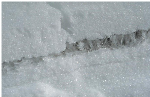
Fig. 3: This photograph of a collapsed surface hoar layer is probably the most influential and has triggered many ideas and debates over the last 15 years (from Jamieson and Schweizer 2000).

Hence, under most conditions snow failure under mixed-mode loading is due to shear failure. However, when considering the microstructure of snow, high local stress concentrations may occur (Schneebeli 2004) leading, e.g., to tensile failure. In other words, at the scale of bonds, any failure mode seems possible (Schweizer and Jamieson 2008). In this context, it is important to note that the collapse of weak layers that is observed after failure follows from the structural damage in the highly porous microstructure of weak layers during crack propagation (Figure 3). Collapse is not a failure mode but a consequence of failure. The fact that there is vertical displacement does by no means imply that there was a compressive failure 1 .