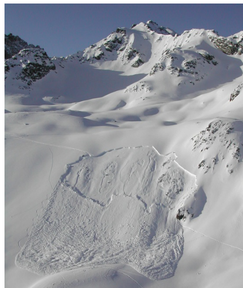
Fig. 1: Dry-snow slab avalanche

following only focus on the formation of this type of avalanche (Figure 1). Such avalanches result from a sequence of fracture processes including (i) failure initiation in a weak layer underlying a cohesive snow slab, (ii) the onset of crack propagation,