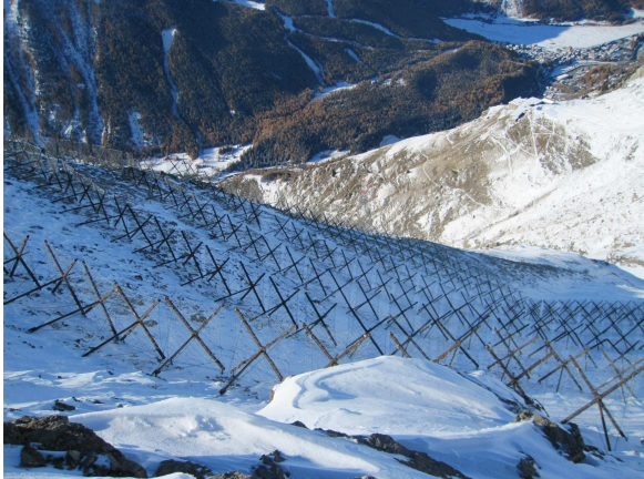
Figure 1: Cogne – Licony - snow umbrellas.

bridges and snow nets have been built in 172 sites (Fig. 1) together with numerous passive structures, such as deflecting or restraining dams, and 36 tunnels were built to prevent closure caused by avalanches on the national and regional roads (Fig. 2).