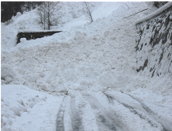
Figure 2: example of deposition area that blocks the tunnel entrance and obstructs the road for about 20 m.

bridges and snow nets have been built in 172 sites (Fig. 1) together with numerous passive structures, such as deflecting or restraining dams, and 36 tunnels were built to prevent closure caused by avalanches on the national and regional roads (Fig. 2).